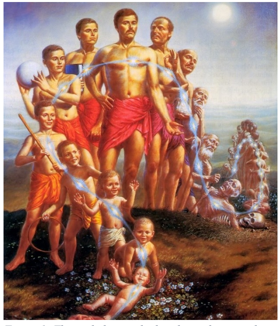
Figure 1: The soul changes bodies, but it does not change

We all know and realize that life is temporary and has