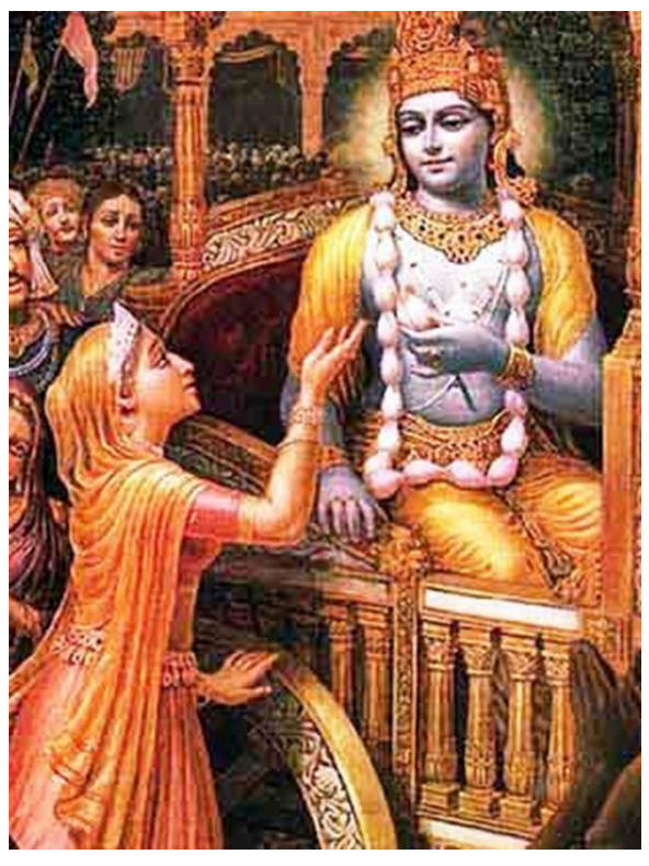
Figure 3: Queen Kunti asking Shri Krishna for a strange boon

Some saints are seen to undergo physical suffering even after God realization. For instance, Tulsidas Ji suffered from the stomach disease sangrahani