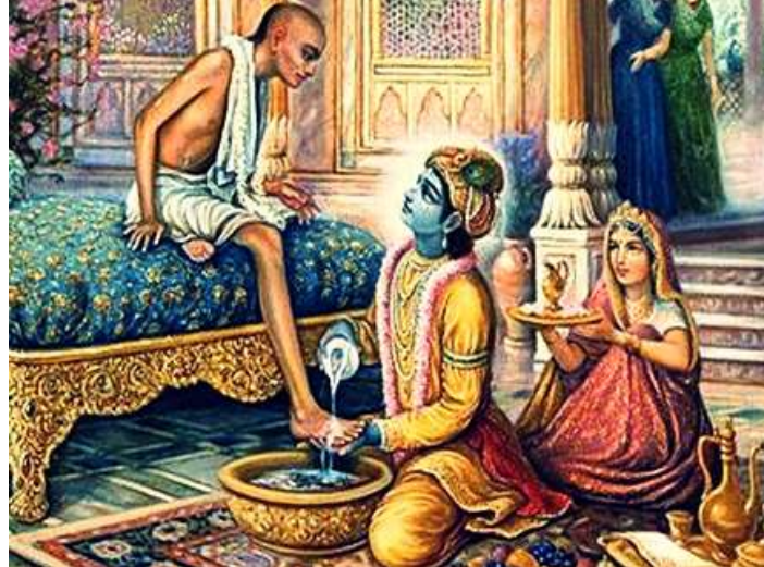
Figure 2: In Dwarika Shri Krishna welcomed Sudama by washing his feet with tears of love

The seventh form of bliss is the bliss of Mathura, where the Supreme Lord behaves like an ordinary human being