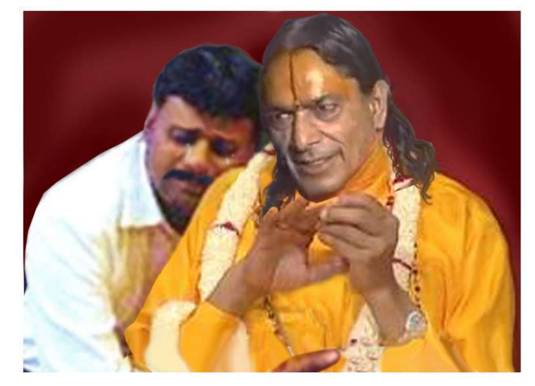
Figure 2: Maharaj Ji said, "Your wife scrubs me with wood-ash. See how my skin is peeling off".

One day, their 5 year old son disappeared from their home. Everyone started looking all over but could not