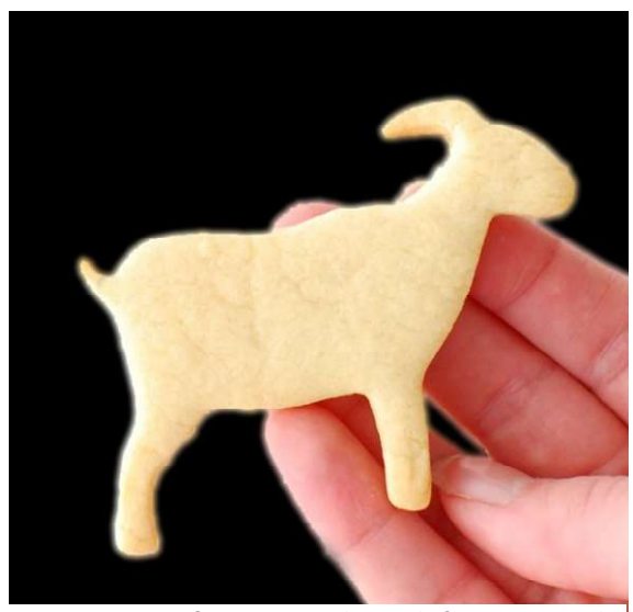
Figure 1:sugar figurine is made purely from sugar and nothing else

We are the soul and this body is given to us, with the sole objective of realizing the ultimate goal of life i.e. attaining permanent, ever-lasting, ever-increasing happiness.