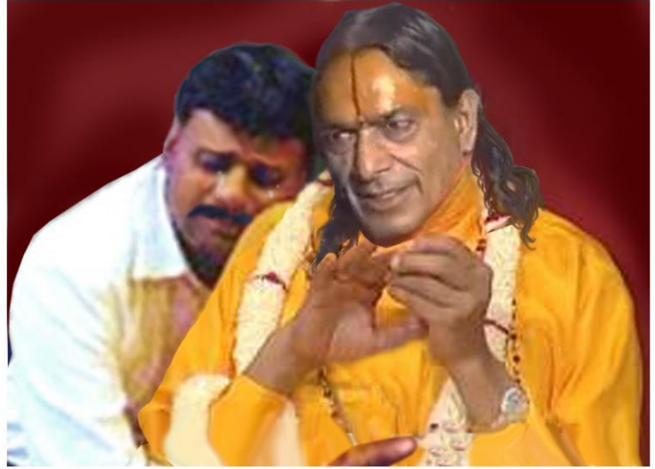
Figure 2: Maharaj Ji said, "Your wife scrubs me with wood-ash. See how my skin is peeling off".

One day, their 5 year old son disappeared from their home. Everyone started looking all over but could not locate the child. At 5am the next morning, there was a knock on the door and the little boy was standing at the door unscathed. Everyone was anxious to know where had the child been. He told them how he had been kidnapped by 4 people. He further said, “That man, whose picture we have on the wall in our