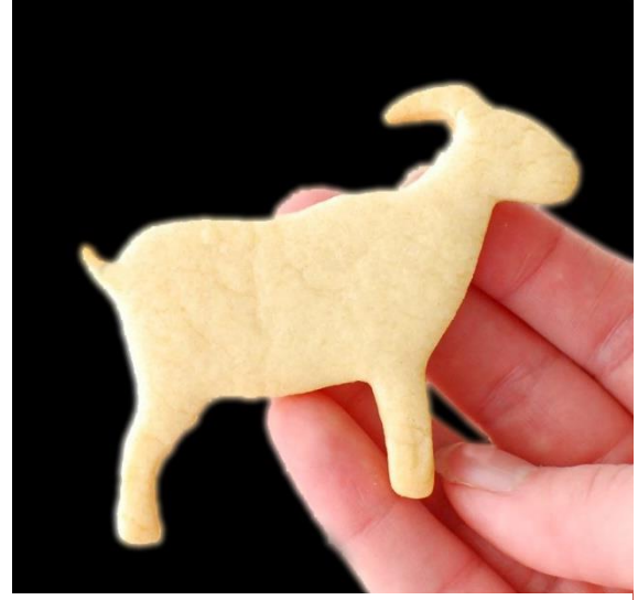
Figure 1: sugar figurine is made purely from sugar and nothing else

We are the soul and this body is given to us, with the sole objective of realizing the ultimate goal of life i.e. attaining permanent, ever-lasting, ever-increasing happiness.