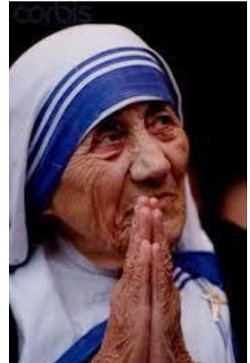
Figure 3: Mother Teresa was humble and kind

The rich man was stunned by her response. He could not believe that someone could be so kind and humble as Mother Teresa was. He was immediately consumed by a strong sense of shame and remorse and was a