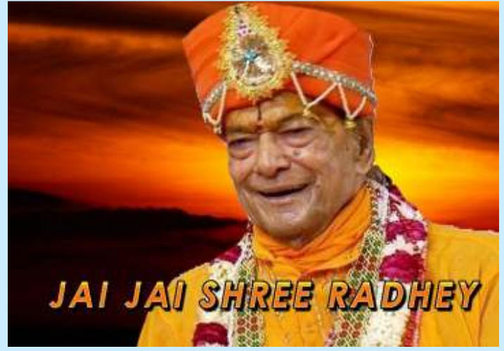
A devotee writes with love for Him -