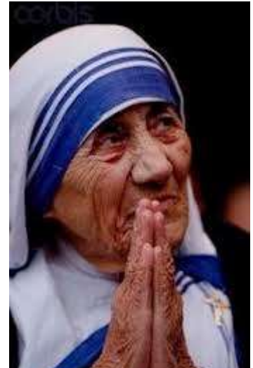
Figure 3: Mother Teresa was humble and kind

The rich man was stunned by her response. He could not believe that someone could be so kind and humble as Mother Teresa was. He was immediately consumed by a strong sense of shame and remorse and was a