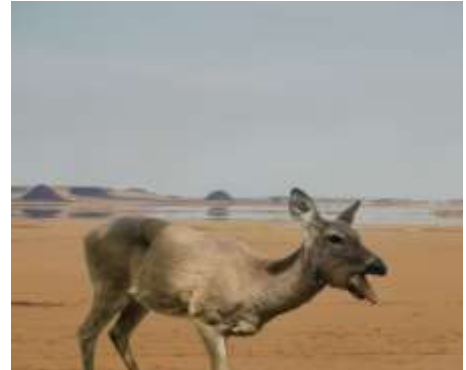
Figure 2: Thirsty deer searching for water in a desert

Suppose a thirsty deer is running hither and thither in a desert in search of water, but being in a desert he does not find water. If someone advises the deer that you can't find water in a desert, the deer may stop running. But ponder, would it quench his thirst? No. Now he would ask, where is water? Then he would need direction to reach the source of water to quench his thirst. Merely knowing the direction would not quench his thirst. The deer has to follow the directions, reach the source of water and drink it. Only then will it quench its thirst.