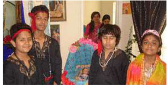
Kids waiting to perform a drama based on the story