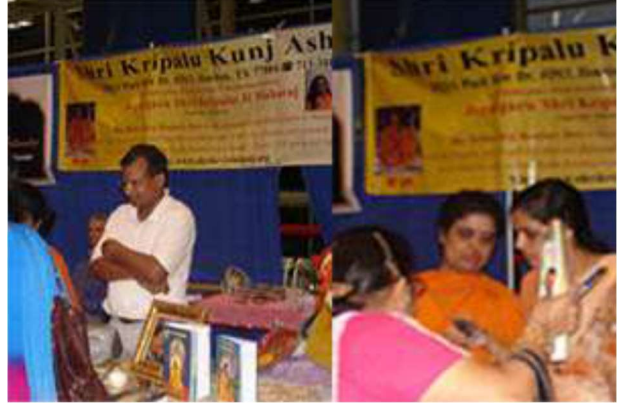
Volunteers attending the visitors at the Shri Kripalu